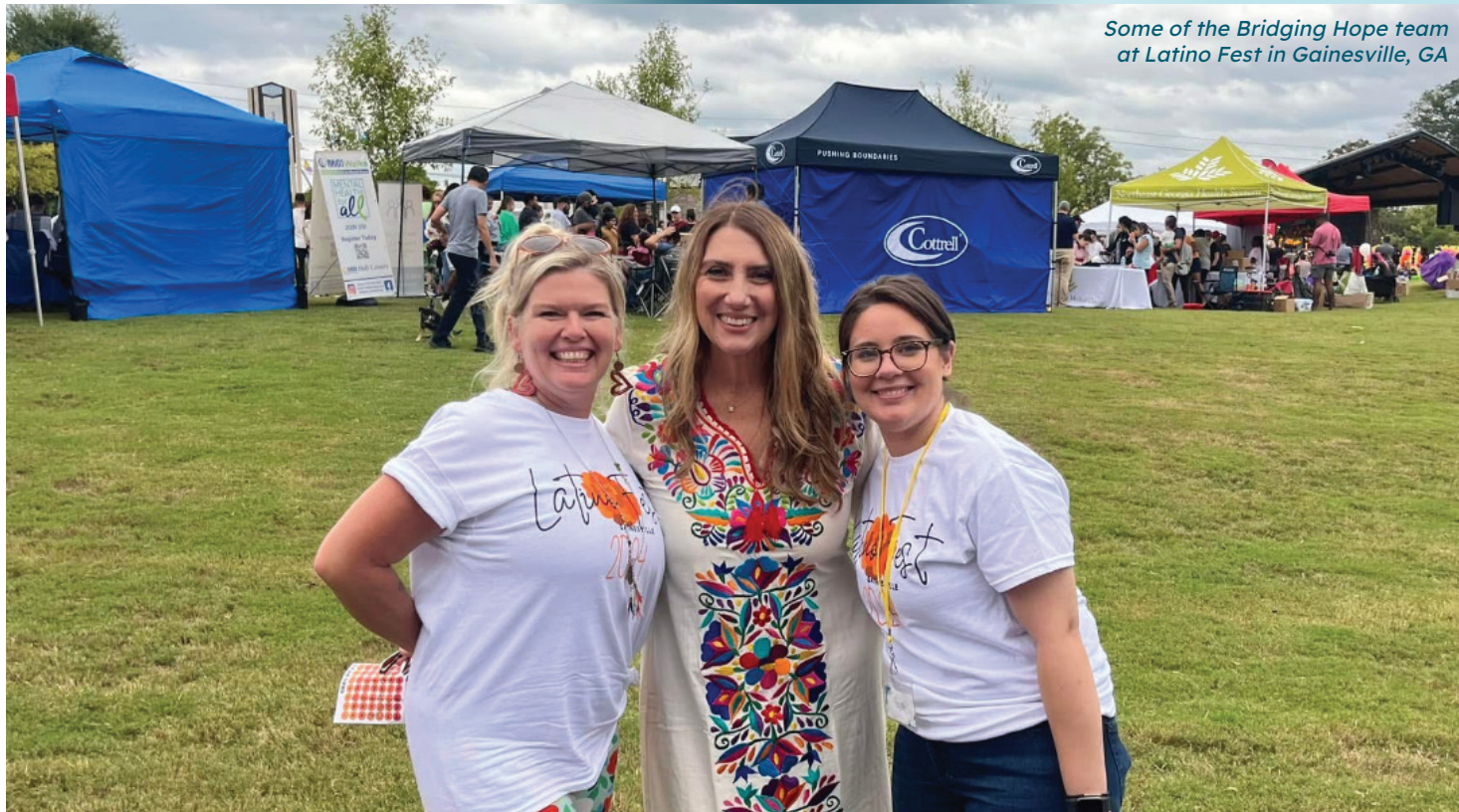
Some of the Bridging Hope team at Latino Fest in Gainesville, GA