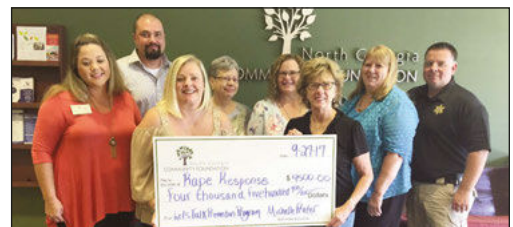
North Georgia Community Foundation Community Impact Grant Award; L-R: NGCF Staff & RR Executive Committee